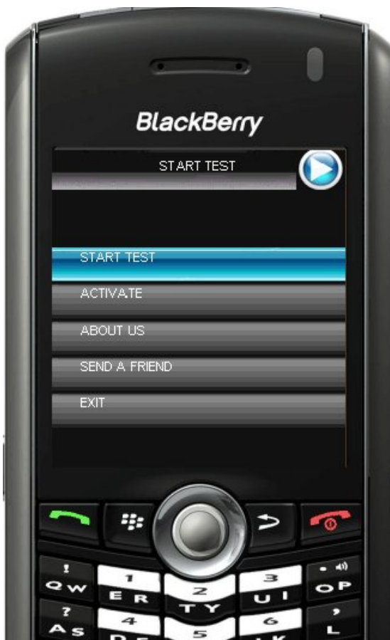
Select Start Test